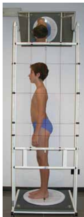
FIG. 1 Postural examination in lateral view: body posture leaning anteriorly with head and shoulders projected forward in relation to the buttocks (front scapulium) and body barycenter moved forward.

The frenectomy or frenotomy is a surgical procedure