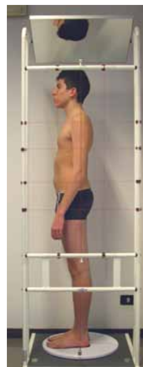
FIG. 5 Postural examination in lateral view: correction of the head and neck position 4 months after lingual frenectomy.

indicated for cases of ankyloglossia with functional impediment.